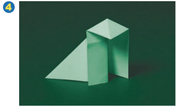
打開剛摺着的地方向下壓 Open the pocket and flatten