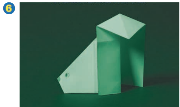
畫上眼睛及鼻子，完成 Draw eyes on two sides and a nose to finish