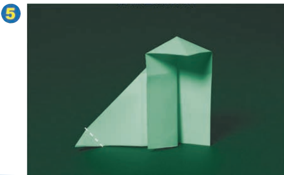
沿虛線向內摺 Fold at the dotted line inward