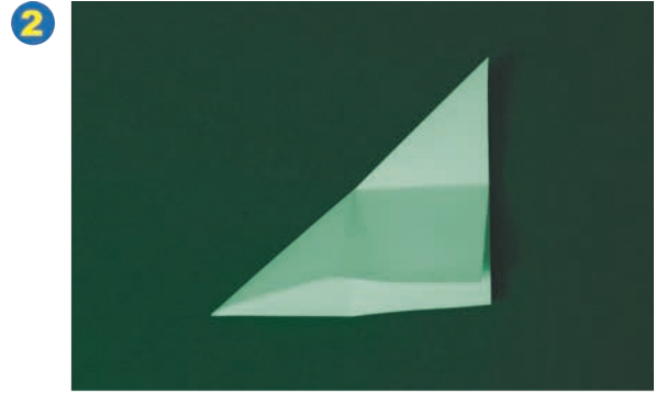
對角對摺成三角形 Fold over to make a triangle