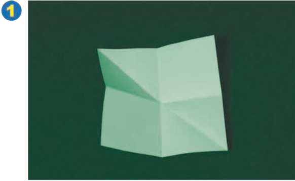
將一張正方形的紙上下對摺， 留下四個小正方形的摺痕 Fold a square paper in half two times to make creases with four squares