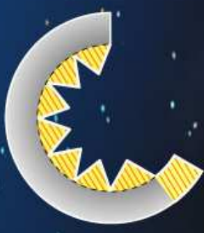
3A A communications antenna with 2 metres in diameter