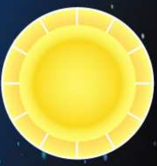
4A A communications antenna with 2 metres in diameter